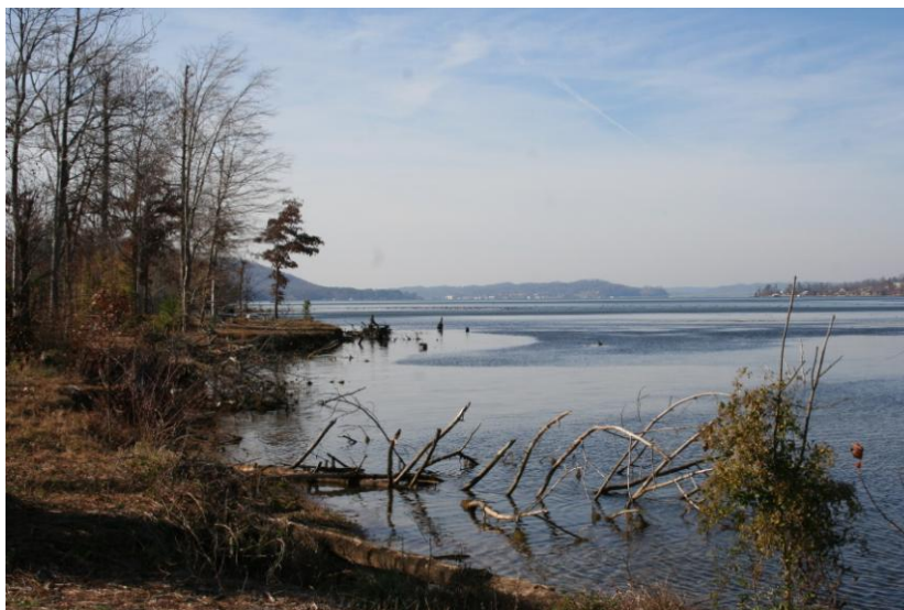
The Beauty of Lake Guntersville State Park