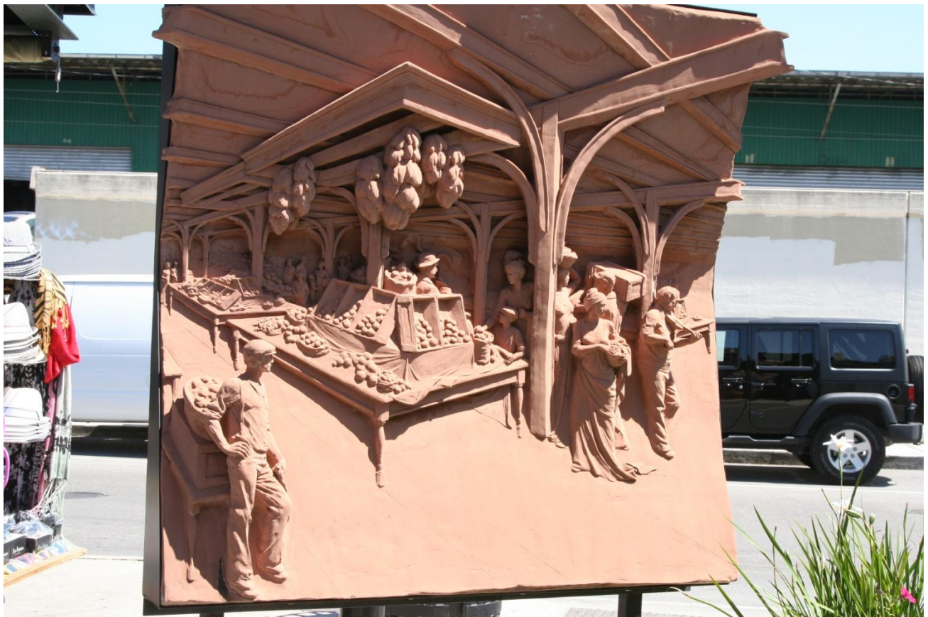
Relief carving on plaster – New Orleans French Market