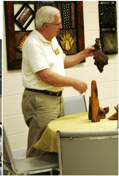
“Show and Tell”